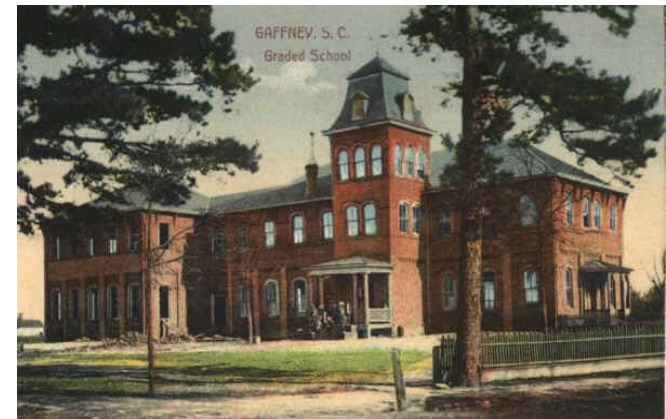
Original Central School Building, c. 1900