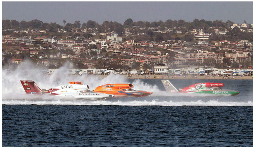
Karl Pearson photo