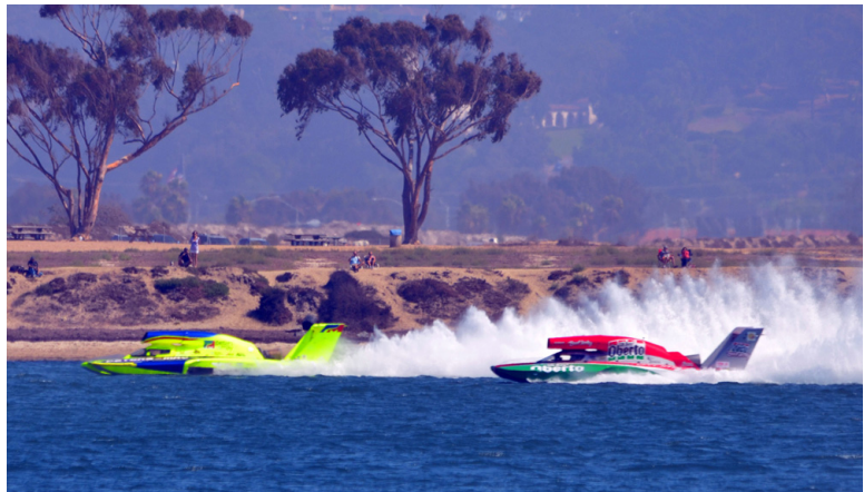
Karl Pearson photo