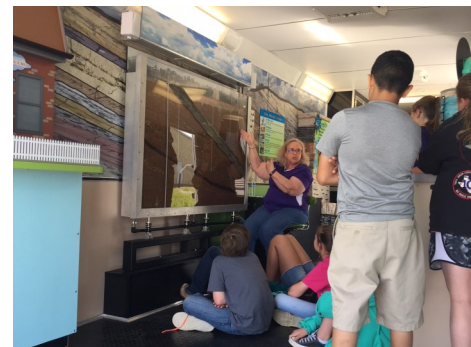
Students can visualize how aquifers and groundwater works with the WET's hands-on, working aquifer model.