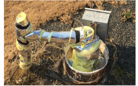
Residential well in Johnson County