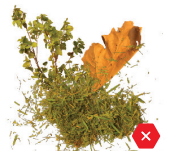
NO Green Waste NO desechos verdes