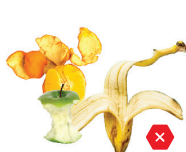
NO Food or Liquids NO comida o líquidos

No Incluir En Su Contenedor De Reciclaje