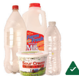
Plastic Bottles & Containers Botellas y envases de plástico