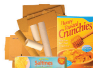
Flattened Cardboard & Paperboard Cartón y cartulina aplastados