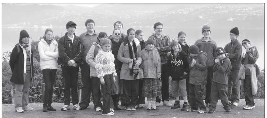
A beautiful day for the visit to Somes Island in Wellington Harbour