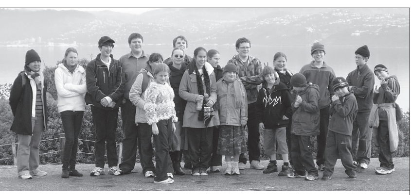
A beautiful day for the visit to Somes Island in Wellington Harbour

The week finished with a prize-giving together with special awards devised by the girls and (separately) by the boys! Every camper completed a 4-, 8- or 16page or multi-frame project.