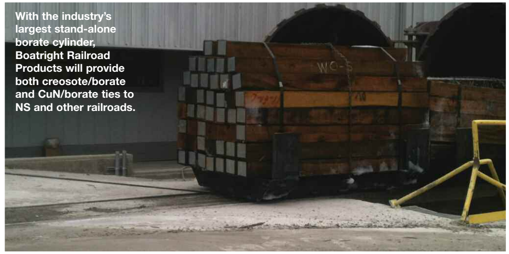
With the industry's largest stand-alone borate cylinder, Boatright Railroad Products will provide both creosote/borate and CuN/borate ties to NS and other railroads.

Another RTA member will play a role in advancing CuN technology in 2012. No