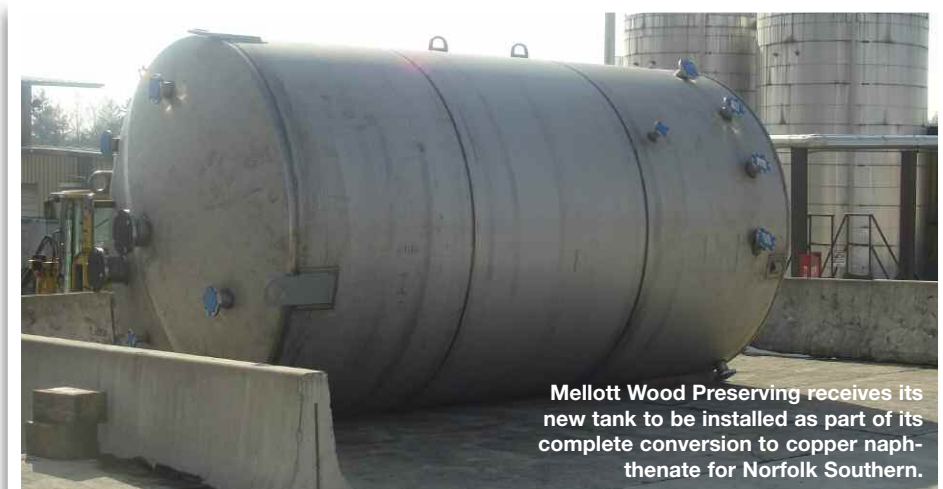
Mellott Wood Preserving receives its new tank to be installed as part of its complete conversion to copper naphthenate for Norfolk Southern.