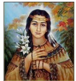
Feast Day: July 14

Kateri contracted smallpox at the age of four which scarred her skin. The scars were a source of humiliation in her youth; she was commonly seen wearing a blanket to hide her face. Her entire family died during the smallpox outbreak, so Kateri was raised by her uncle, a Mohawk chief.