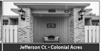
Jefferson Ct. • Colonial Acres