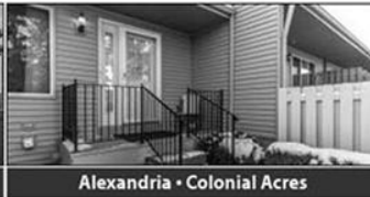
Alexandria • Colonial Acres