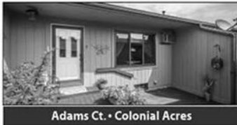
Adams Ct. • Colonial Acres

"We offer a competitive listing fee that we know would excite any seller"