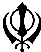
Deg Teg Fateh

"Deg-O-Teg O Fateh-Nusrat-I -Bedrang Yafat -Az Nanak--Guru Gobind Singh" i.e, "The kettle ( Deg )- (The Sikh symbol of economy, the means to feed all and sundry on an egalitarian base), sword ( Teg )-(The Sikh symbol of power, to protect the weak and hapless and smite the oppressor), victory and unending patronage are obtained from Gurus Nanak-- Gobind Singh ". After Banda Singh this inscription was adopted by the Sikh Misals and then by Sikh rulers for their coins also. Now the official seal of Akal Takhat bears this inscription.