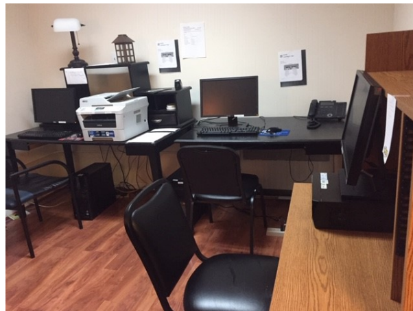
Pictured here are three of the four computers located at PI East Warren facility.

All you have to say is, "I'm interested," and our Club members will lead the way. We're always hoping to help you find YOUR niche in our Club.