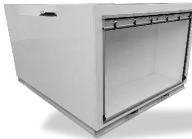
Easy Loading Forklift Pocket Base with Mounting Points