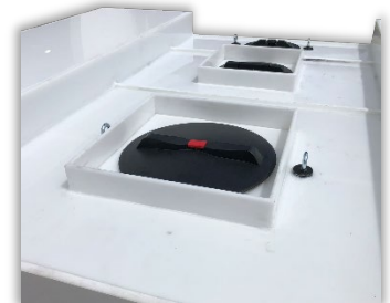
Compact Multi-Tank Configurations