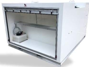
Roll-Up Doors Secure Storage Mini-Warehouse!