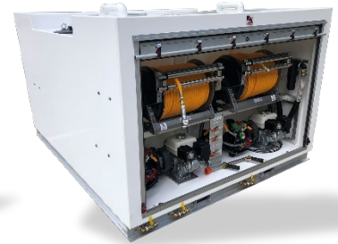
Safely Access Reels Pumps & Tanks