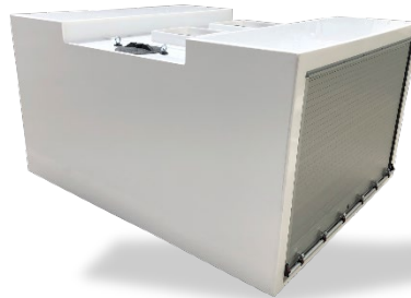
Smooth Surfaces for Logos & Marketing