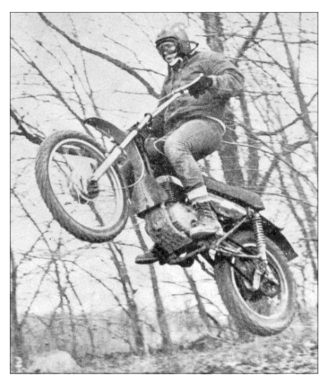
I love this shot. It looks like his back wheel is about a foot off the ground and he's sucking his shorts.

There was also an article about the 6<sup>th</sup> Annual Kaw Valley Enduro in Lawrence, KS, held on November 22, 1970. That puts it before the formation of the Black Jack Enduro Circuit by about six years. There were 206 starters and 68 finishers. There were only 5 check points with a 20mph speed average. They also had 7 observation checks.