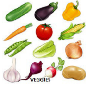
Fruit & Veggies