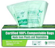
100% Certified Compostable bags