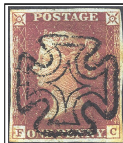
Maltese cross cancellation

The mark used to cancel Penny Blacks and Twopenny Blues was a red Maltese cross. This usually fell on the centre of the stamp, unlike modern cancellations. It was possible