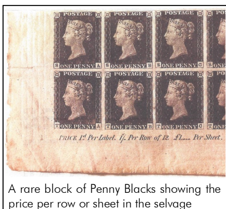
A rare block of Penny Blacks showing the price per row or sheet in the selvage

Both were the same design showing Queen Victoria. The stamps were a huge success and the printers had to work day and night to build up stocks and maintain supplies. They produced an average of about six million 1d blacks each month. Although it was in use for less than a year, because of the millions which were printed they are not very scarce. Nevertheless many collectors want an example of the first stamp.