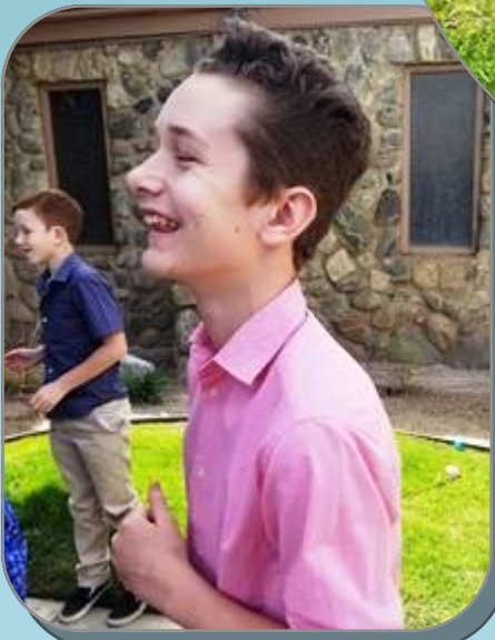
Easter (egg) Joy