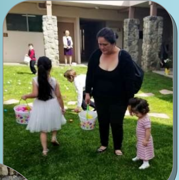
The Easter Egg Hunt on our newly landscaped courtyard