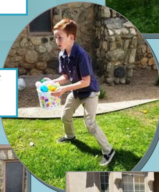
Full basket, but poised to grab some more