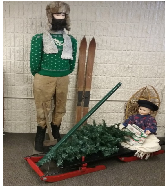
Cutting the Christmas Tree Display at Museum.