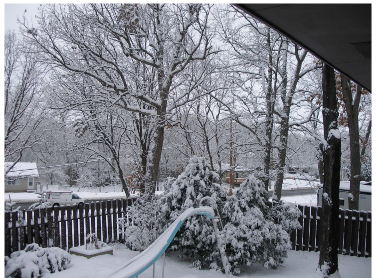
A Maple Grove yard in winter —awaiting the summer swimming season!