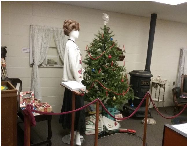
T'WAS THE NIGHT BEFORE CHRISTMAS- Museum Display Decorating the Tree -