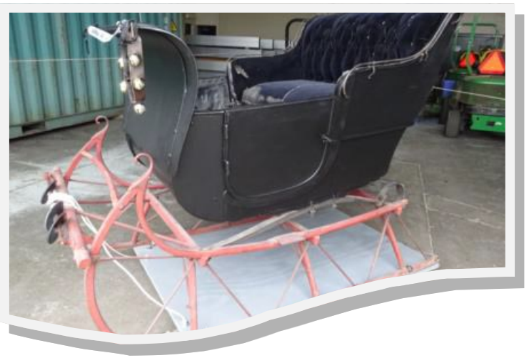
Sleigh donated to Maple Grove Historical Museum

"When I was 4 years old, I used to ride in a cutter sleigh. In early 1920 it was our only means of transportation for our family. Occasionally on Sunday morning if the weather was nice, my parents would dress me in my winter coat, cap, mittens, and overshoes and wrap me in a blanket. They would sit me between them in the cutter and cover the three of us with a buffalo robe. Then we would ride up to Rogers to our parish church and visit my aunt and uncle who lived at a nearby farm. It was always a very cold ride!"