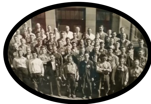
He studied Auto Mechanics at Dunwoody Institute using his G.I benefits.