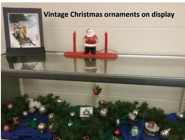
Vintage Christmas ornaments on display