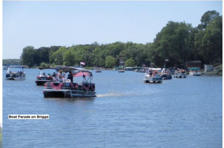
Boat Parade on Briggs