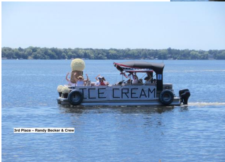
3rd Place - Randy Becker & Crew