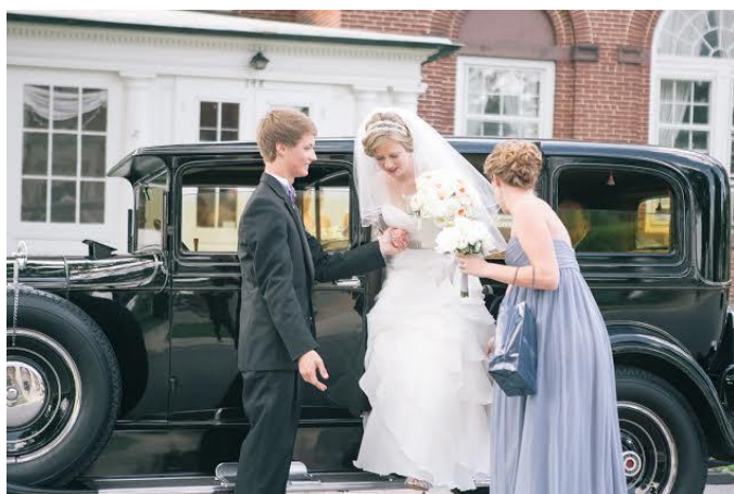
The Bride emerges...