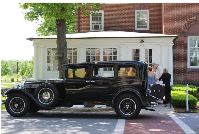
The Bride arrives in style - 1930 740 Packard Limousine