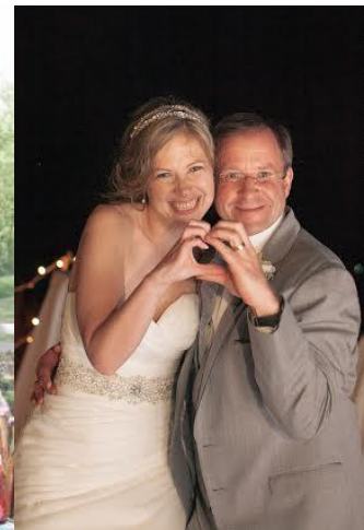
Good Night, Friends

The Bridal Party blocks the view of the cars – but on this day, it's okay