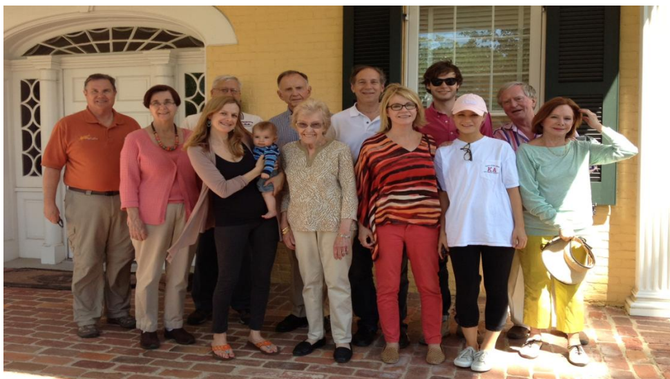
The group poses for a picture after enjoying the tour

Importantly for us, General Marshall also was a Packard enthusiast. When he was named a Brigadier General in 1936, he received a significant pay increase. For the first time, he could afford a new car. General Marshall celebrated by purchasing a new Packard. Marshall's wife later commented about coming home that day and seeing the new car in the driveway: "In front of the cottage stood a beautiful new Packard Car – to replace our little Ford. So [General Marshall] had one thrill out of his generalcy, for a Packard in those times of depression was indeed a marvelous thrill. I was quite overcome with joy."