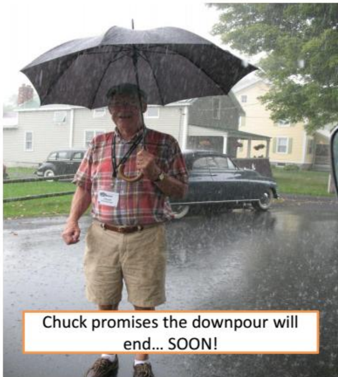
Chuck promises the downpour will end... SOON!

“ A Revolutionary Ramble” took us thru the Mohawk Valley, where we toured three battle sites ending at the OLD STONE FORT, containing an interesting museum of NY artifacts.