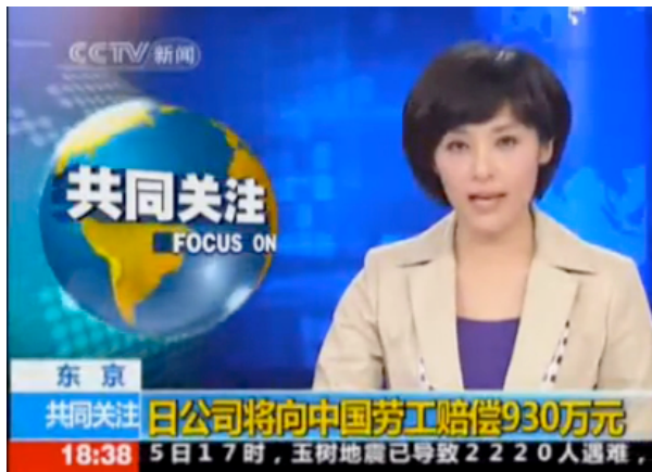
Chinese news coverage of the Nishimatsu-Shinanogawa settlement and its rejection by plaintiffs involved in the lengthy litigation. (CCTV video available)

on April 26, 2010, Nishimatsu continued to include the plaintiffs who had already openly stated their rejection of this Settlement Agreement in its "settlement" arrangements. While Nishimatsu has yet to resolve its wartime forced labor issue, it violates de facto the human rights of the Chinese forced labor victims once again.