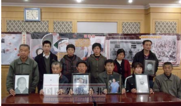
The five plaintiffs in the Shinanogawa lawsuit against Nishimatsu, along with heirs of two other victims, announce their opposition to the compensation pact at a Beijing press conference on April 27.

ambiguously name the damages that they should have paid to the Chinese victims; and (c) Moreover, Nishimatsu unreasonably requires those who accept the "settlement" to bear hereafter the obligation of ensuring that the corporation will be immune from any future liability from any other parties for this case. This article discusses these and other shortcomings of the unacceptable "settlement" in detail.