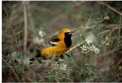
Hooded Oriole