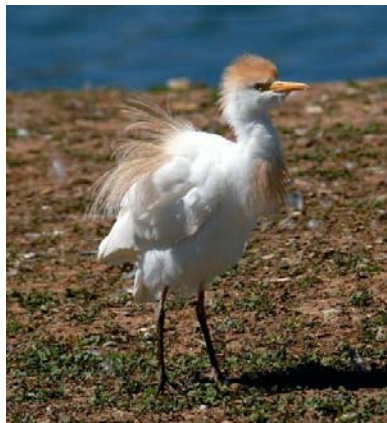
Cattle Egret (Eskin 2008)

What: We hope to see Snowy Egrets, Cattle Egrets, and Black-crowned Night-Herons sitting in their nests with young. If time permits, we will go to other good birding sites.