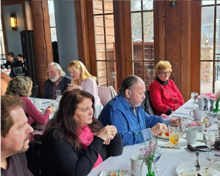
Racecar spelled backwards is Racecar