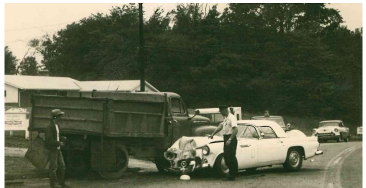
Another sad picture of a Tbird

春分の日 Vernal Equinox Day March 20 - Equal Day/Night Spring Begins