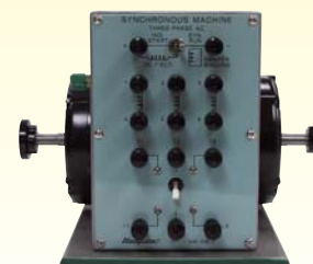
MODEL SM-100-3 Synchronous Machine