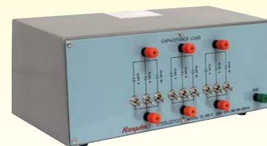
MODEL CL-100-3 Capacitance Load