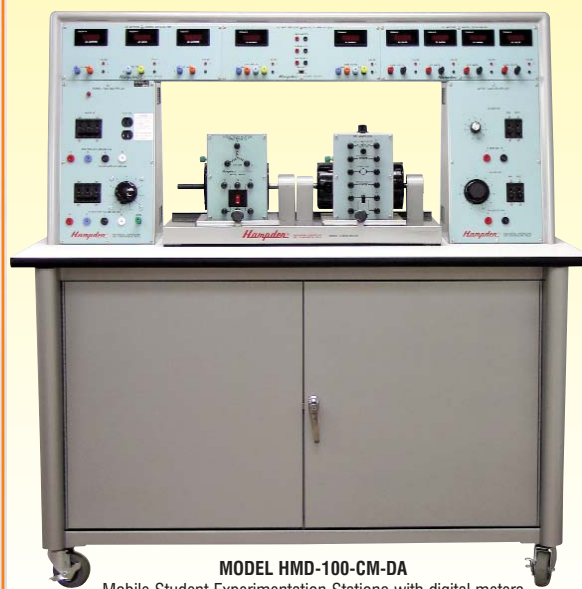
MODEL HMD-100-CM-DA Mobile Student Experimentation Stations with digital meters