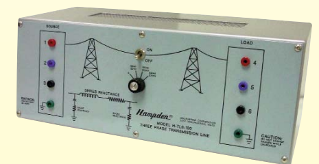
HAMPDEN MODEL H-TLS-100 TRANSMISSION LINE SIMULATOR

Standard Products...Designed to Meet Your Growing Needs!!!