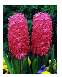
Volume 17 Issue 1 February 2016