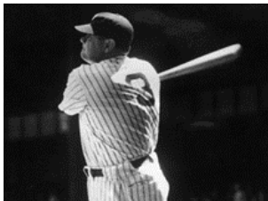
Babe Ruth Day April 27th