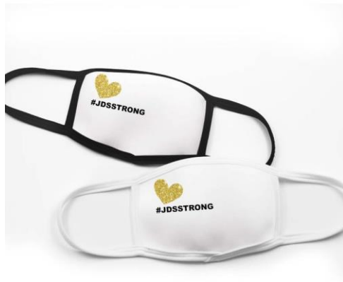
1 face mask