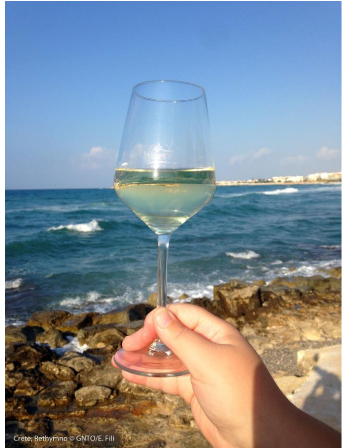
Crete, Rethymno