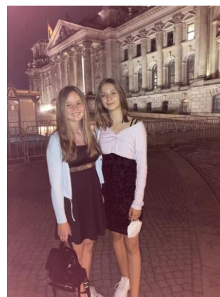
Girls in Berlin

Exchange programs kindle a lifetime of friendship. These two started communicating a year ago when they paired together for the summer exchange program. When Covid-19 prevented that exchange for two summers in a row, they decided to make it happen on their own. They will return to Sheboygan on August 7.