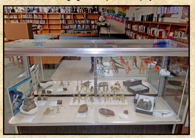
One of the glass dinosaur display cases