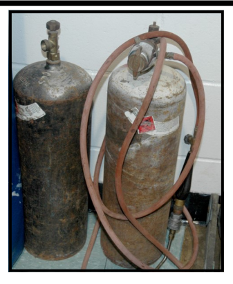
Acetylene tanks, sizes NC and B, $50 each