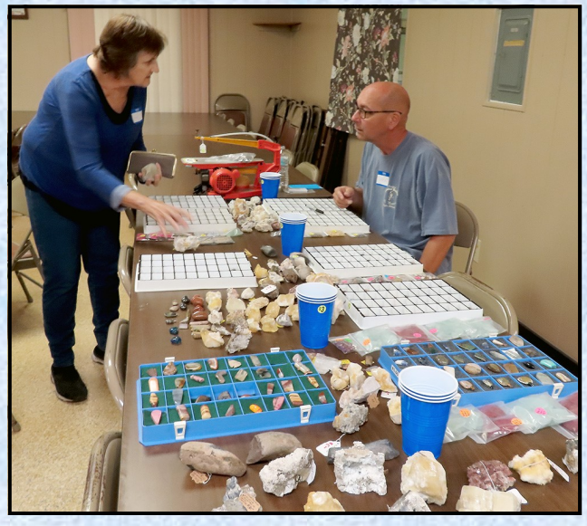
Lots of nice specimens