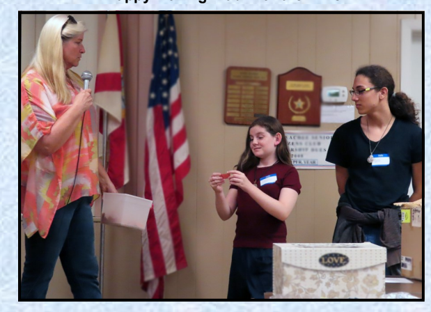
Calling out the 50/50 and door prize numbers