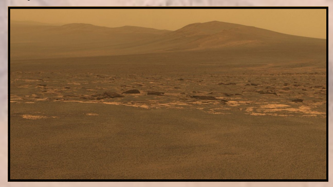
A caramel colored, dusty Martian sky.

Since Mars is one-and-a-half times farther from the sun than Earth, the sun appears correspondingly smaller in the planet's dusty sky. Forget about using the bright sunshine to help spot interesting rocks; it would be like collecting during the afternoon on a slightly overcast day on Earth.