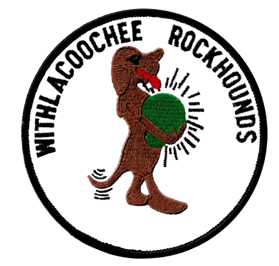
Hernando County, FL

2/2/19—2/3/19 -Central Brevard Rock and Gem Club Kiwanis Recreation Center