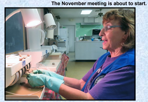
Happy making mud with the Pixie