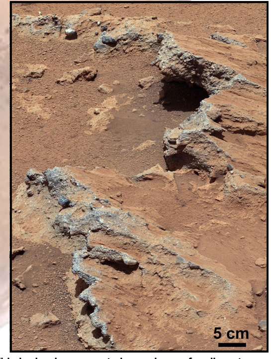
This bedrock appears to be made up of sedimentary rock.

Information from www.wikipedia.org, www.washingtonpost.com, www.space.com, en.wikipedia.org.