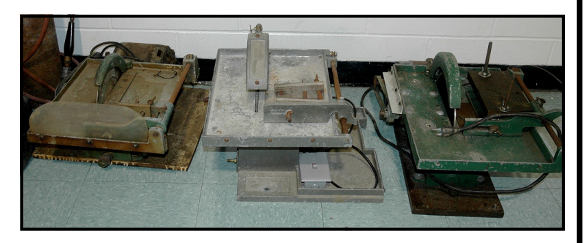
Two ten inch slab saws, $300 each.

2) Mini Sonic vibrator tumblers, four-pound barrels, $150 each