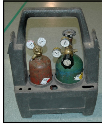
Oxyacetylene welding outfit, Including tanks, regulators and micro torch, $175