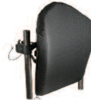
J3™ PL E2615