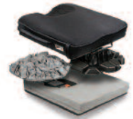
J3™ E2622, E2623 E2624, E2625