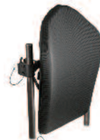
J3™ PA E2613