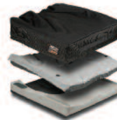
J2™/J2 DC E2622, E2623, E2624, E2625