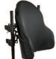
J3™ PD, PDC, PDL E2620