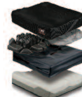
Fusion™ E2622, E2623