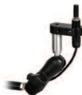
Switch-It Micro Pilot