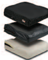
Union™ E2307, E2608