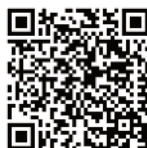
Alternative Drive Control Videos