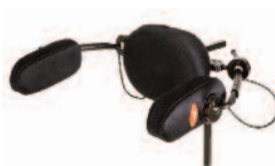
Switch-It Dual Pro™ Proportional Head Array