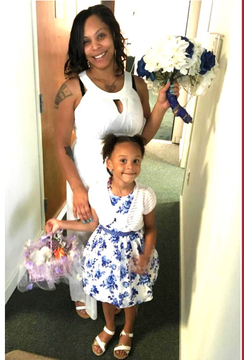
Mother and daughter

Growing up I didn't have a stable family--growing up in foster care. But I thank God everyday for the family He has given to me and I thank my children for accepting