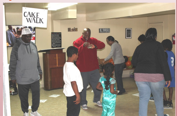
Harvest Party 2018