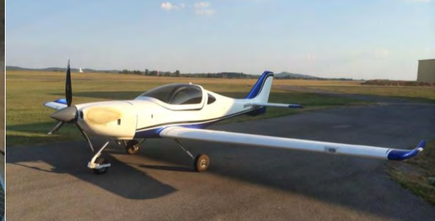
On the Plane

The very latest E-LSA built at the factory by Tom West from Williamsburg, VA. It was good to see him again. What a pretty plane.