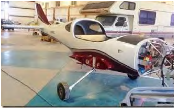
Al's Jet Painted

Al's plane has been painted and he was back working on it. Just a couple of pictures from the blog site.