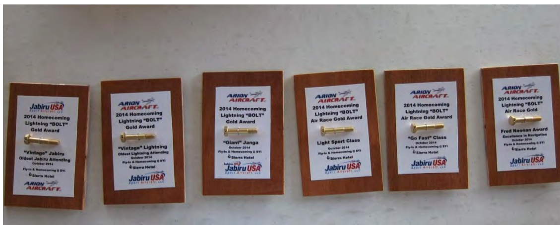
Lightning Bolt Awards