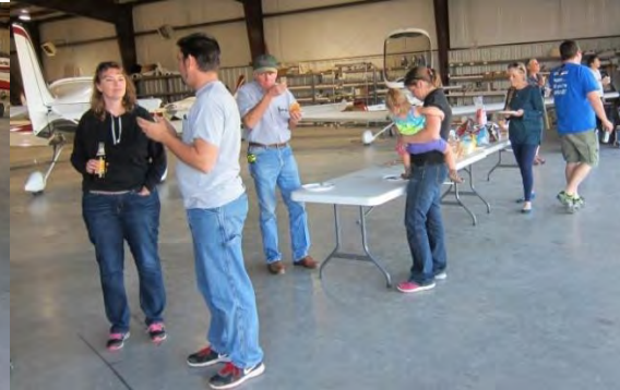
Eating, one of the things we do best.