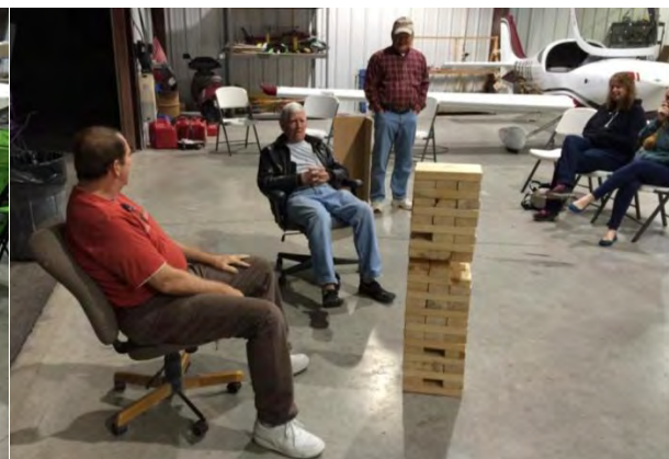
How Old Guys Play Giant Janga