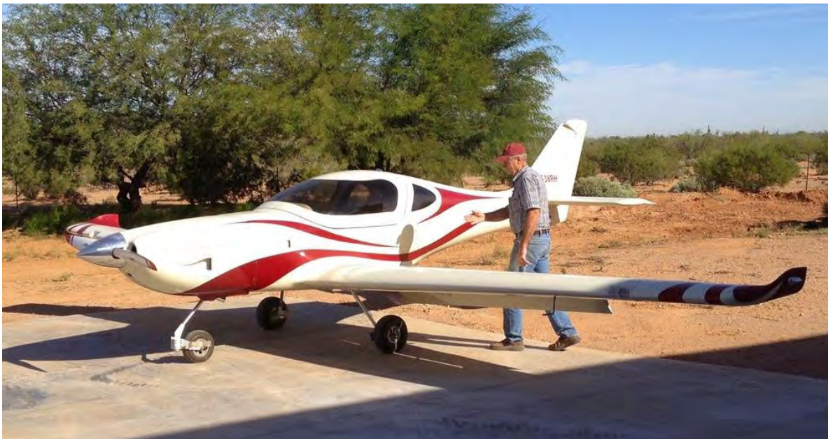
Ready for Taxi Test