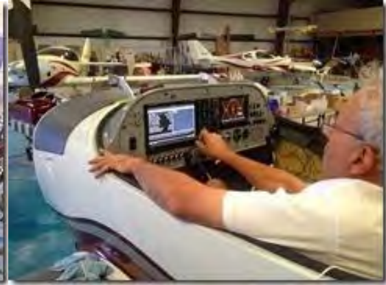
Dynon Panel Coming Up