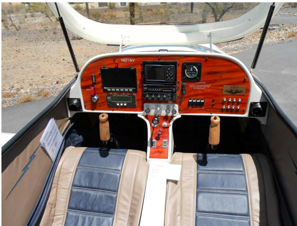
Instrument Panel and Interior of N621WV