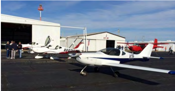
Lightnings at BGF for Breakfast