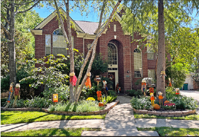
9231 BRAHMS LANE