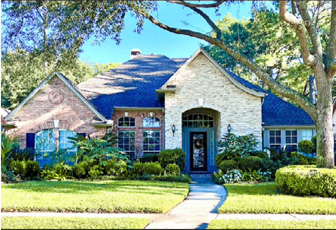
8638 GOLDEN CHORD CIRCLE