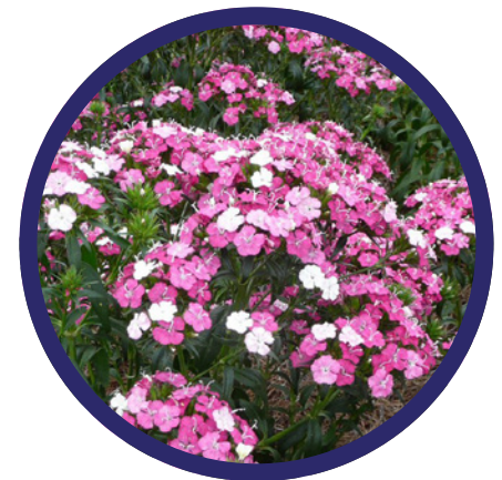
Amazon Dianthus (HEIGHT: 18-36")