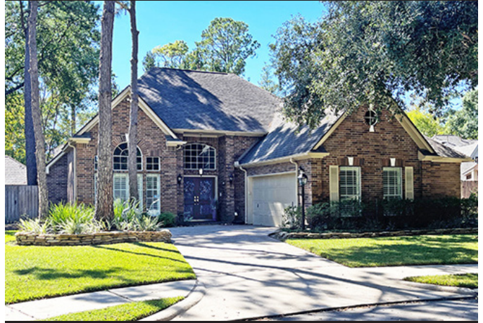
7731 MELODY CIRCLE