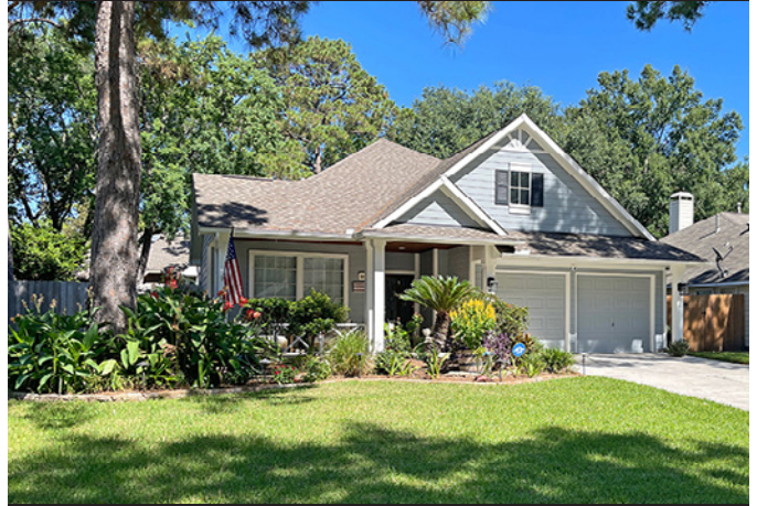
8102 CLARION WAY