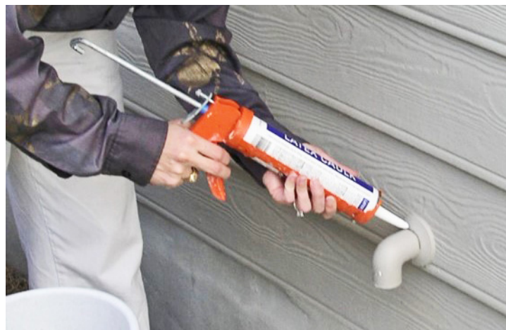
Seal pipe and wire penetrations with copper mesh, sealant or expanding foam.

The Texas A&M AgriLife Extension Service provides equal access in its programs, activities, education and employment, without regard to race, color, sex, religion, national origin, disability, age, genetic information, veteran status, sexual orientation or gender identity.