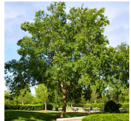
Drake elm (Chinese elm, lacebark elm)