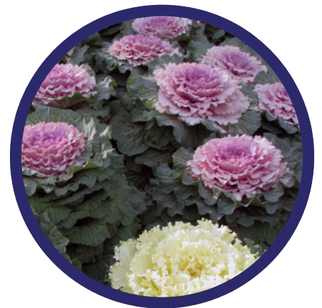
Kale (ORNAMENTAL CABBAGE)