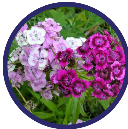
Dianthus (HEIGHT: 6-12")