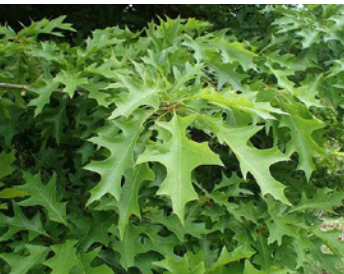
Leaves of nuttall oak

The Shumard oak is a red oak that’s popular here, but the nuttall is a better choice because it’s so tolerant of our soggy, clay soil.”