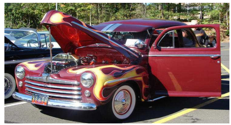
48, Flathead powered