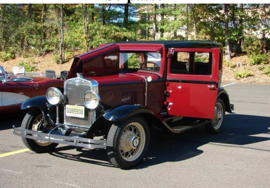
Not a Model A, it's a brand X -but nice