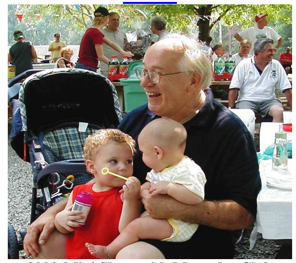
2002-Mini Show with Mercedes Club Who is that cute guy with the white shirt in back?