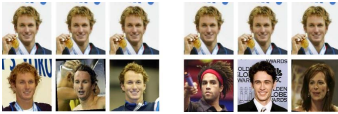
Fig. 4. Similar and Different Pairs Related to One Individual