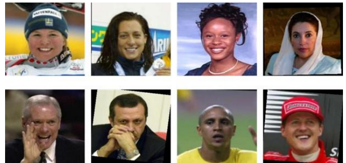
Fig. 3. Some samples of LFW dataset images

Achieving high accuracy in recognition by using a small number of training samples for single-class samples is a difficult task for face recognition algorithms. LFW dataset has small-sized samples of face images for each person. Deep learning models need large numbers of samples to train