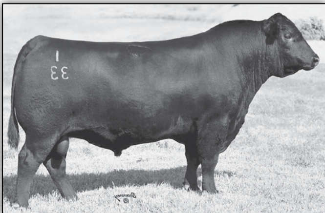
CONNELY BLACK GRANITE