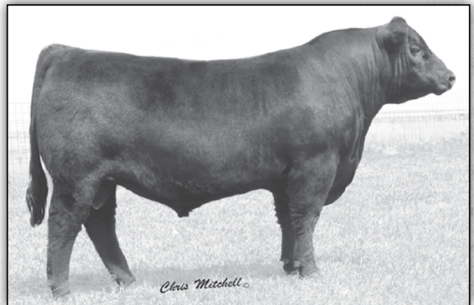
CONNELLY CONFIDENCE 0100

Bred to calve February 14, 2019, to MGR TREASURE. Exposed to RV BAR Confidence R612. Examined Safe.