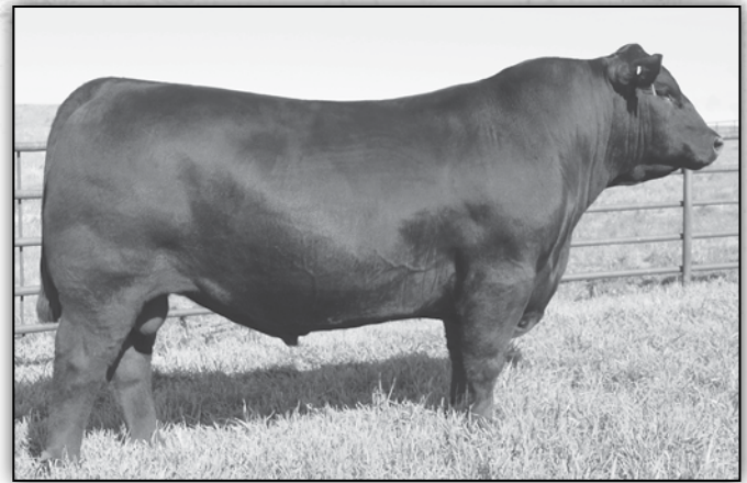
S A V TEN SPEED 3022 - His influence sells.