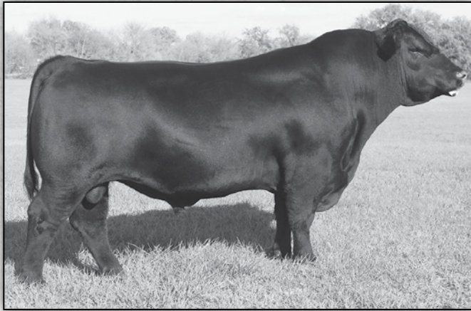
BOYD SIGNATURE 1014 - His influence sells.