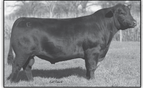
BALDRIDGE BRONC Reference Sire E.

A HA Cowboy Up 5405 [AMF-CAF-DZF-DDF-W1F-NHF-OHF-OSF] Birth Date: 1-30-2015 Bull *18286467 Tattoo: 5405