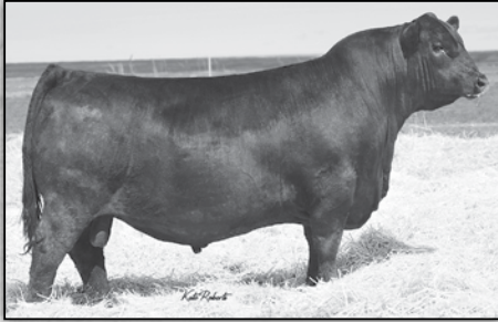
HA COWBOY UP 5405 Reference Sire A.