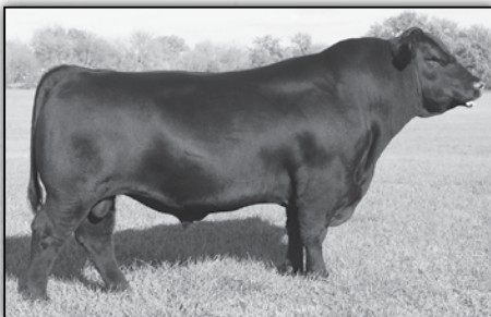
BOYD SIGNATURE 1014 Sire of Reference Sire B.