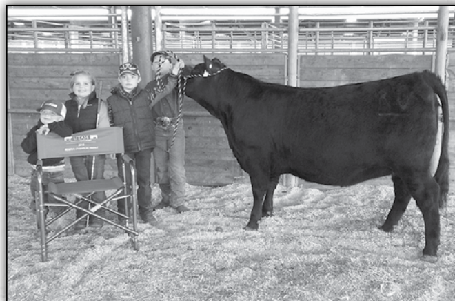
RV Bar Elba 785 - Lot 4's half-sister Reserve Champion Female at the Utah Angus All Breed Bull and Female Sale April 2018.