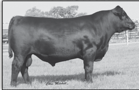
DEER VALLEY ALL IN Reference Sire I.