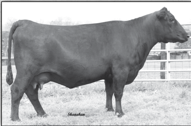
QHF BLACKCAP 6E2 OF4V16 4355 - Her influence sells.