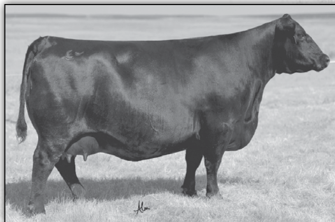
BALDRIDGE ISABEL Y69 - Her influence sells.

• Individual records: WR 107. • Dam records: WR 1@107.