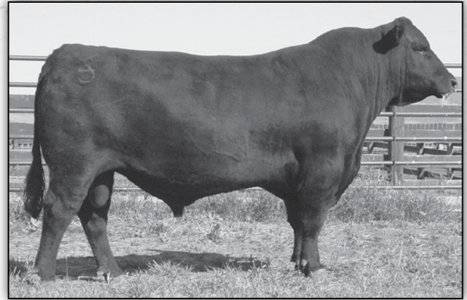
AAR TEN X 7008 SA - His influence sells.