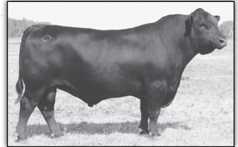
MYTTY IN FOCUS Reference Sire K.

G SITZ SENSATION 693A [AMF-CAF-DDF-M1F-NHF-OHF] Birth Date: 1-23-2013 Bull 17470735 Tattoo: 693A