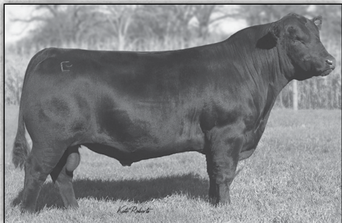
BALDRIDGE BRONC - His influence sells.