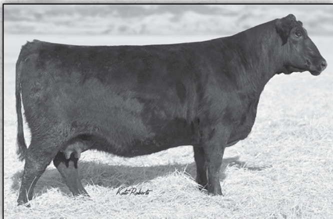
HA BLACKCAP LADY 1602 - Her influence sells.