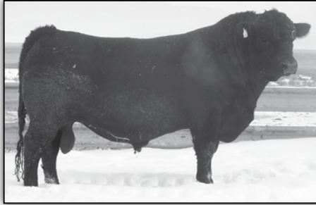
RV EXAR R013 Reference Sire C.