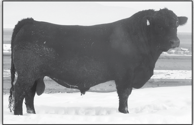
RV EXAR R013