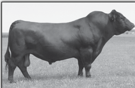
QUAKER HILL RAMPAGE 0A36 Reference Sire D.