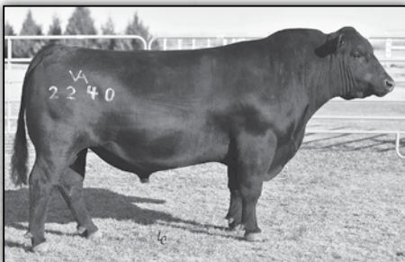
VAR DISCOVERY 2240 Reference Sire H.