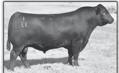
CONNEALY BLACK GRANITE Reference Sire L.