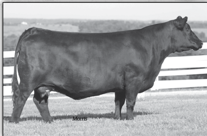
AAR LADY KELTON 5551 - Her influence sells.