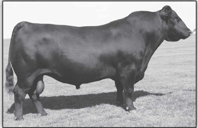
CONNELY FINAL PRODUCT