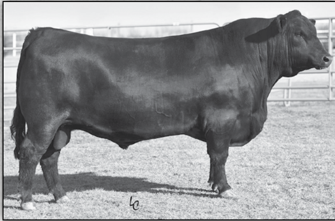
SITZ SENSATION 693A - His influence sells.