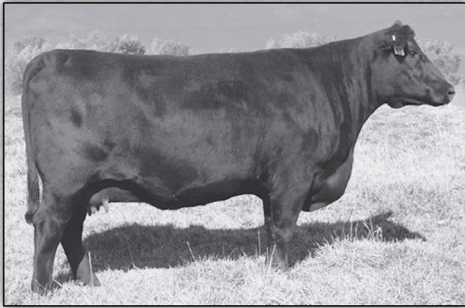
MYTTY COUNTESS 906 - Her influence sells.