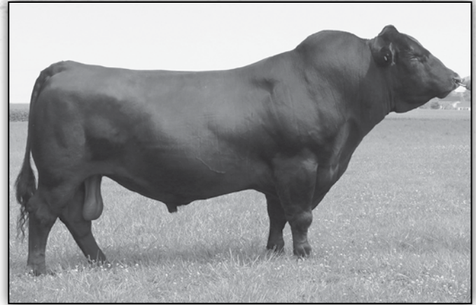
QUAKER HILL RAMPAGE 0A36 - His influence sells.