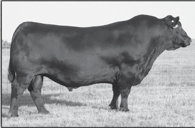
SAV 8180 TRAVELER 004