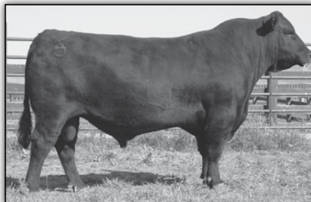
AAR TEN X 7008 S A Reference Sire J.