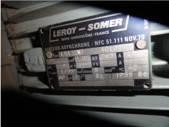
Turning gear motor name plate