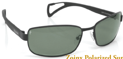
Zoinx Polarized Sunglasses www.zoinxsunglasses.com www.amazon.com

What's HOT for Fall? To achieve a tall and slimer look go with sophisticated High Waisted Pants . This classy look prevents the dreaded butt cleavage when you bend down, and helps keep a "belly roll" in check. Trench Coats aren't just for detectives and brooding French film noirs actors. This fall they're a wardrobe accessory to pair with about anything. The Skinny Scarf is a "GO" with layers that can make a blouse, coat or sweater give off a cool-chick-vibe. As does the Backpack . Designer backpacks are in all year, but great colors for fall are black, brown, nude and pastel. What is a Car Wash Skirt you ask? With regular fringe out, this skirt is a perfect fall look and shows a little bit of skin. It's edgy and a nice breather from regular fringe. If a trench is not your cup of tea, how about other coat versions like Puffer Cats ? For cozy and fashionable, puffer coats are like wearing your fav cozy bed quilt! To go with any fashion you