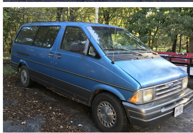
VAN 1994 Ford Van, 7 passenger, some rust on bottom, 180,068 miles