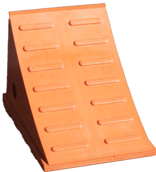
6 lb Extended Base Chock WC-UO650

Convenient Carrying Handle and Rope Hole