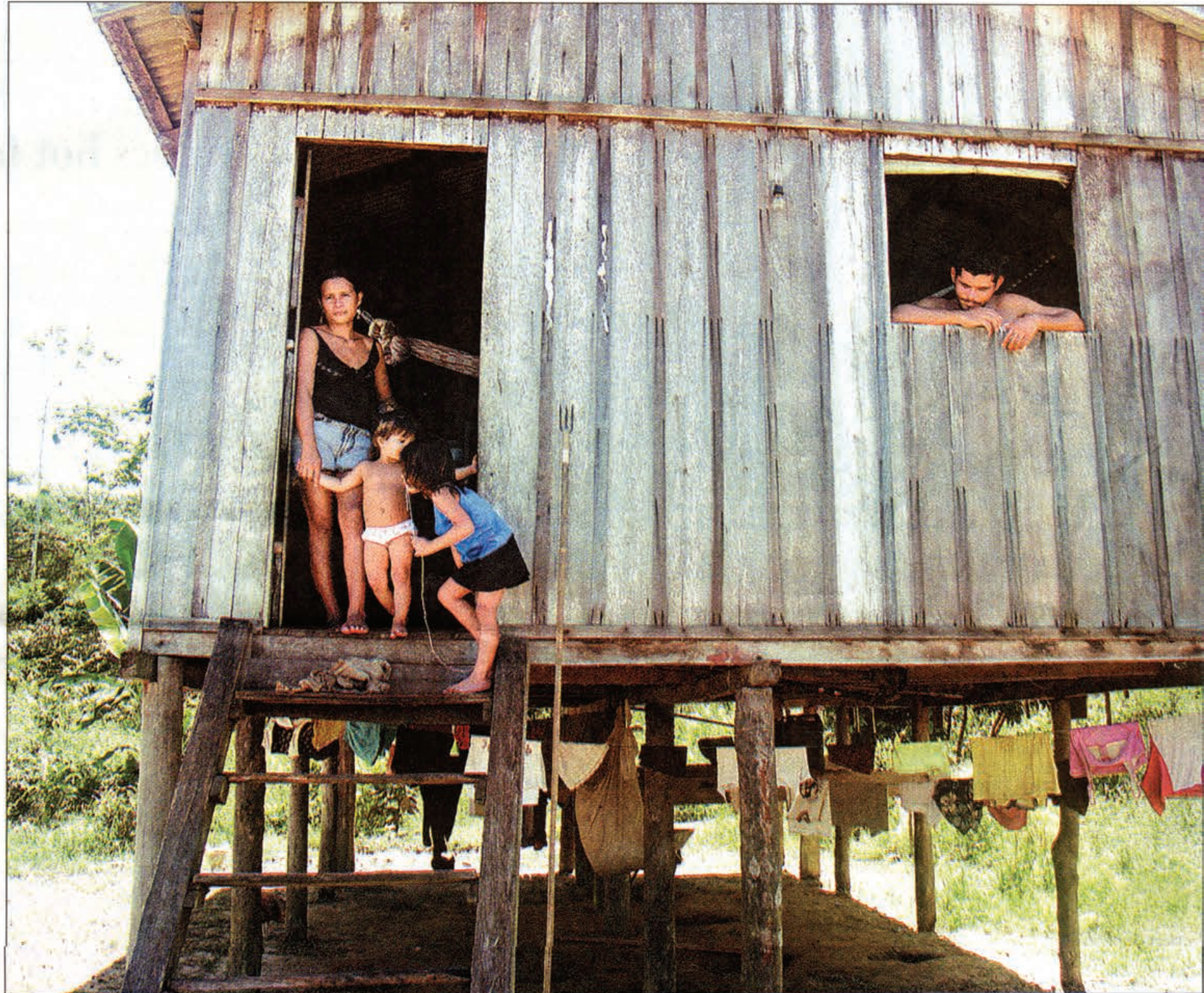
The cola-colored Rio Negro (top) gets its name from dissolved organic matter in the river. A Caboclo family (above) waits out a sweltering afternoon in their home along the Rio Negro.

After breakfast, you'll be off in the launch again. This time, it will be to explore the flood plain adjacent to the Rio Negro. Perhaps you'll flush out a colorful owl butterfly or encounter a spider the size of your fist straddling an enormous web capable of snaring a bird. Maybe you'll come across shards of pottery left by an ancient indigenous tribe and excavated by an agouti paca (South American rodent) as it dug its burrow. Or perhaps you'll stumble upon a centuries-old kapok tree, its buttressed girth so