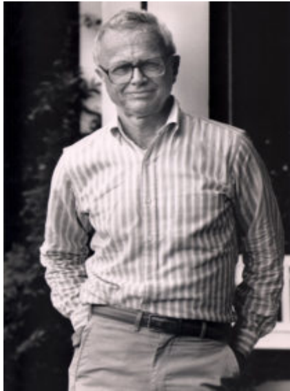
William Zinsser at the house in Connecticut where he wrote On Writing Well in summer of 1974

William Knowlton Zinsser (October 7, 1922 - May 12, 2015) was a Princeton graduate, World War II veteran, newspaperman, American writer, editor, literary critic, and teacher. He began his career as a journalist for the New York Herald Tribune , where he worked as a feature writer, drama editor, film critic, and editorial writer, and has been a longtime contributor to leading magazines.