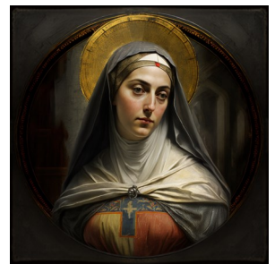
Feast Day: March 9

Sources: franciscanmedia.org and saintfrancesofrome.org