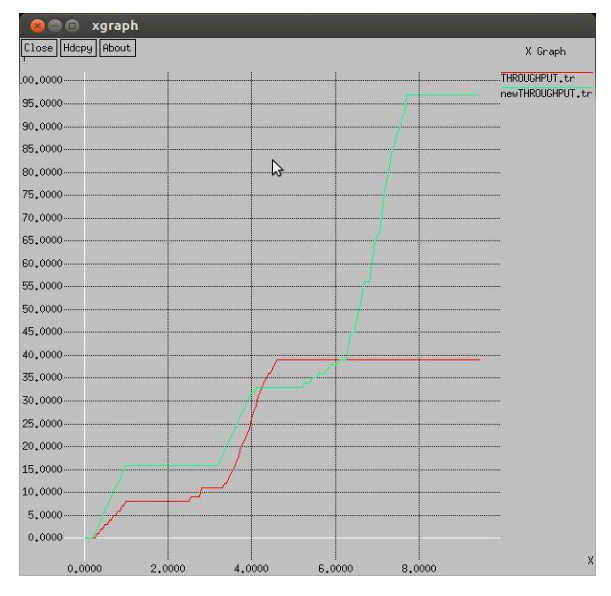
Fig.1: Throughput graph

As shown in this figure 1, the existing throughput is shown by the red line and the proposed throughput is presented here by the green colored line. The time is given as x-axis and numbers of packets to be transmitted are shown at the y-axis. As per the graph, it is seen that the throughput of proposed technique is higher in comparison to the throughput of existing technique.