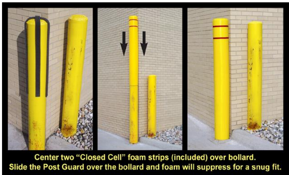
Center two "Closed Cell" foam strips (included) over bollard. Slide the Post Guard over the bollard and foam will suppress for a snug fit.