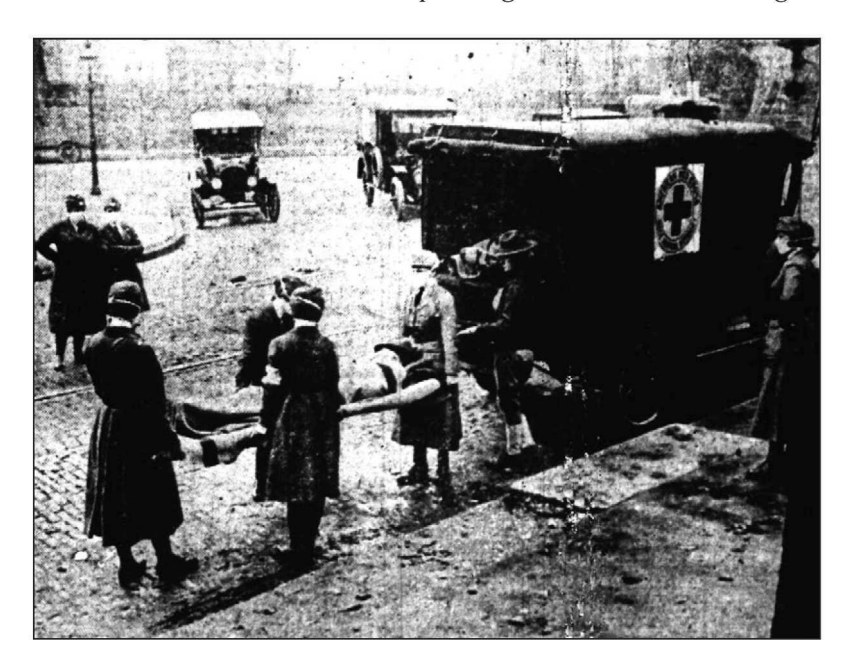
St. Louis Red Cross nurses moving an influenza victim.

Across the city, groups cancelled meetings, and schools called off their fall sporting events. Football and soccer coaches were quoted as saying that they would be willing to sacrifice the teams' schedules in order to prevent influenza from spreading. The St. Louis Tuberculosis Society opened information clinics so that health advice on influenza could be distributed, and doctors and nurses in the public school system volunteered to help during the outbreak.<sup>33</sup> Although the majority of St. Louis citizens