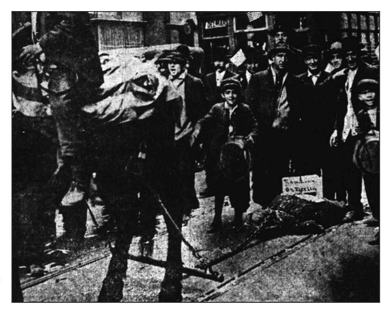
Celebrants dragging an effigy of the German kaiser in a St. Louis parade marking the World War I armistice. St. Louis Post-Dispatch, November 12, 1918. SHSMO

of business establishments, schools, and churches, the Medical Advisory Committee agreed to resume the city's normal course of business on November 13.48 Starkloff agreed the following week to lift the majority of the rules regarding the limits on public gatherings, although a few minor restrictions remained in place. The health commissioner decided to lift the closing because the influenza appeared to be slowing, as only about ten new cases a day were emerging in the various wards.<sup>49</sup> With schools reopening and all restrictions removed, it appeared by the end of