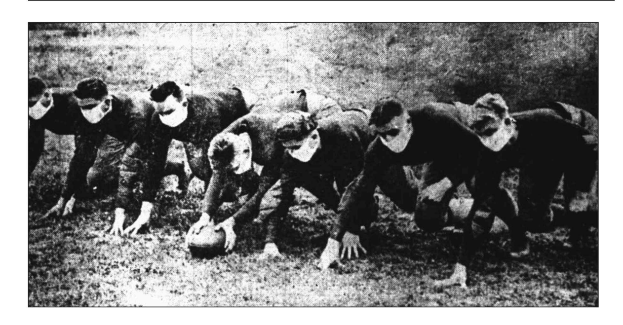
The Washington University football team wearing masks during the influenza epidemic.

[St. Louis Post-Dispatch, October 11, 1918. SHSMO]