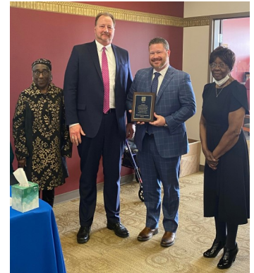
Wheelan-Pressly Funeral Home