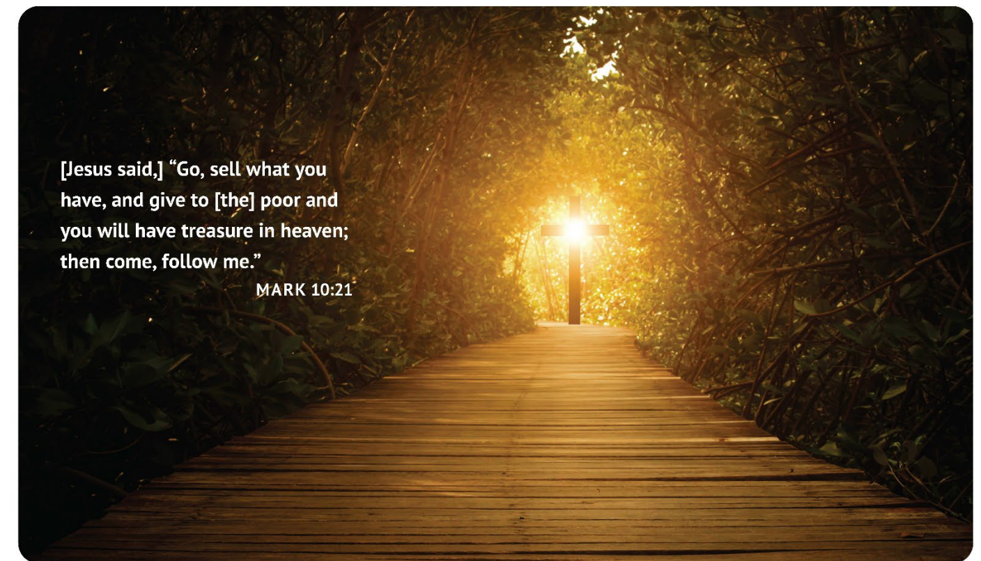
© 2024 LIGUORI PUBLICATIONS, A MINISTRY OF THE REDEMPTORISTS • IMAGE: DEER WORAWUTE / SHUTTERSTOCK