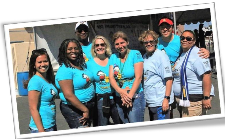
WEF Board Members 2017-2018