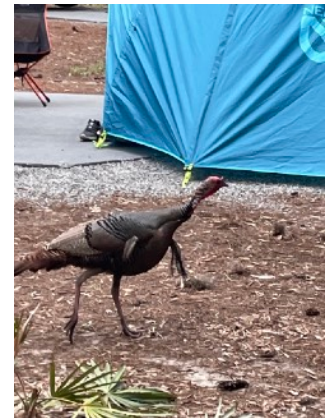
DISNEY TURKEY: REAL OR ANIMATRONICS?

After dinner everyone went to Disney Springs so that they could get themselves souvenirs. The whole group met at Hollywood Studios so we could all ride the Tower of Terror together before we left. After this incredible and thrilling dropper